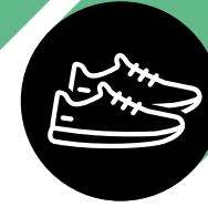
Shoes (textile and leather)