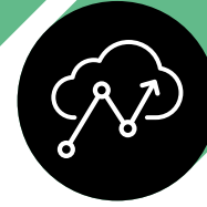
Trends & Digital