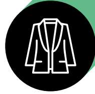
Fashion (textile and leather)